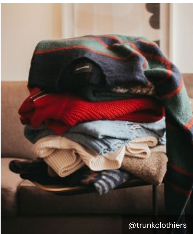
Trunk Clothiers 8 Chiltern Street, Marylebone