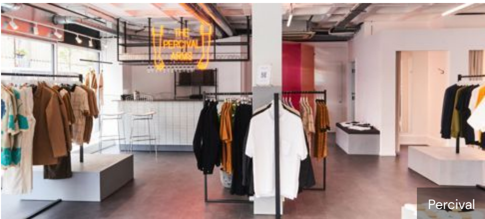
Percival 7 Marshall Street, Soho