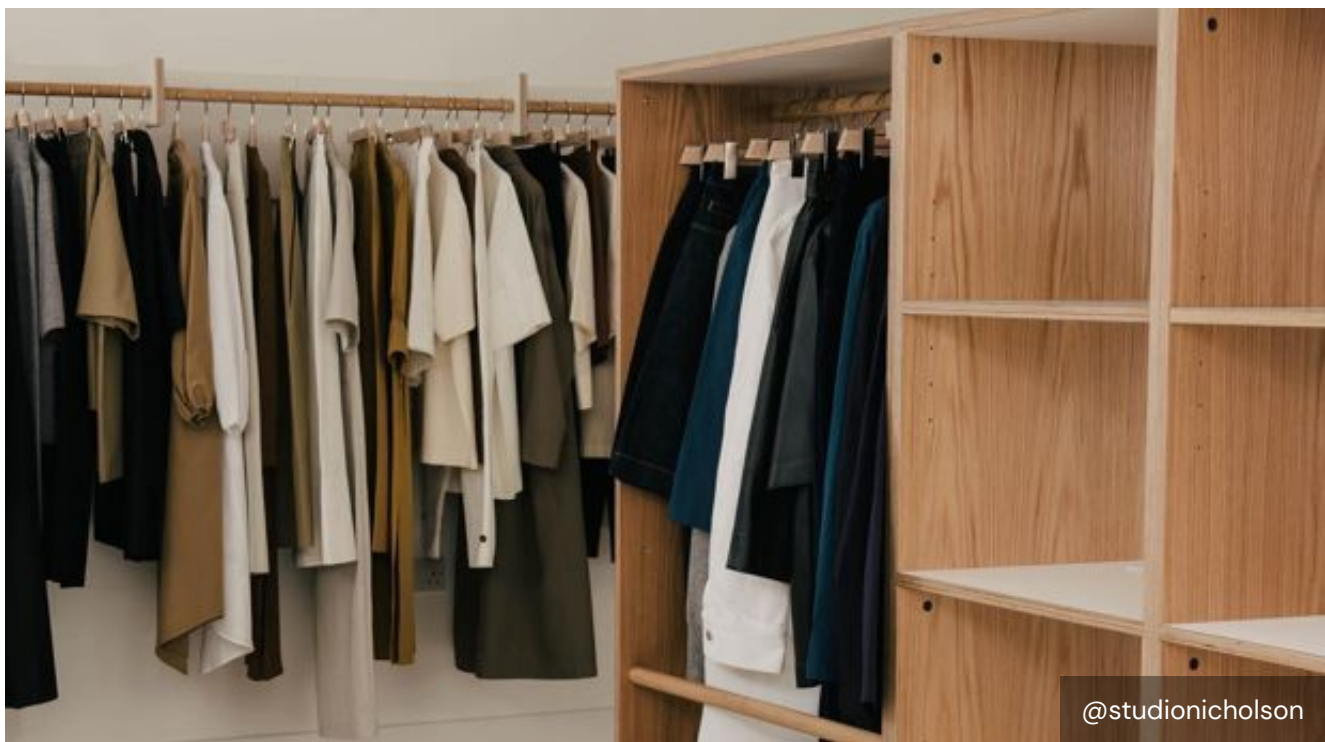
Studio Nicholson 9–11 Broadwick Street, Soho