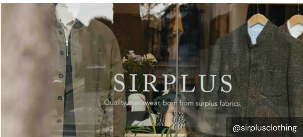
Sirplus 81a Marylebone High Street, Marylebone 178a King's Road, Chelsea