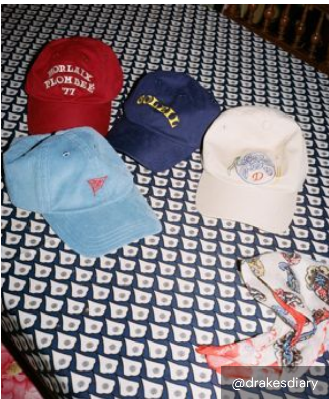
Drake's 9 Savile Row, Mayfair