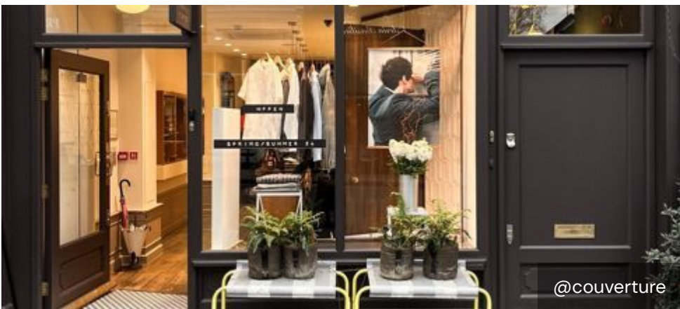
Couverture & The Garbstore 188 Kensington Park Road, Notting Hill